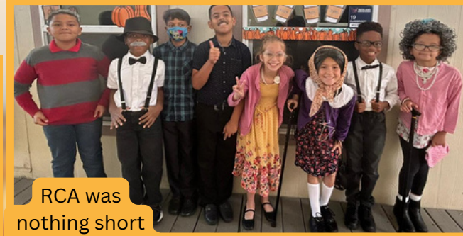
RCA was nothing short of outrageous during our Red Ribbon “Spirit Week”